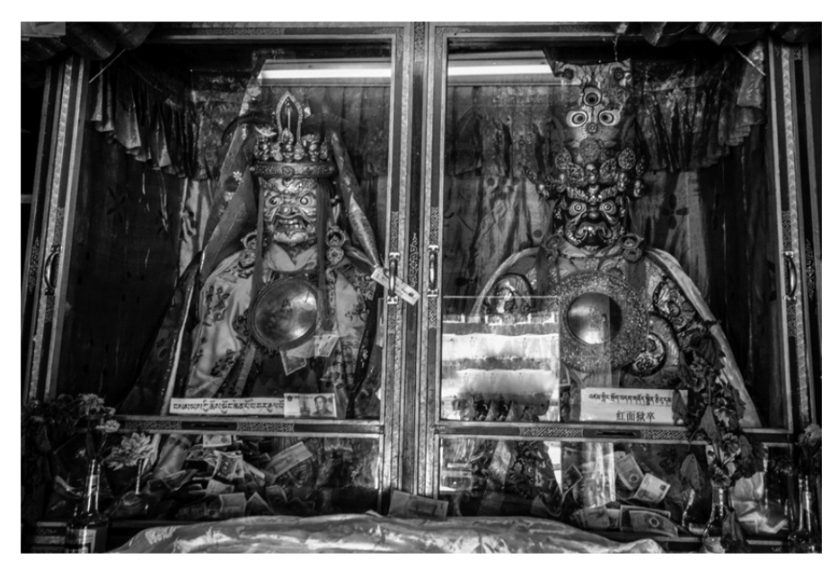
Figure 4. Statues of Pehar and Tsiu Marpo at Pehar Kordzöling ( pe-har dkor-mdzod gling ), Samyé Monastery.

One final observation about the Ten-Chapter Sādhana is that throughout these multiple editions, mantras are added and subtracted, and their spelling and pronunciations change. If the proper recitation of mantras is important to the successful completion of a ritual,<sup>23</sup> then these differences carry certain implications about the nature of error within Tibetan ritual architecture. Regardless, the Ten-Chapter Sādhana is representative of how treasure texts are not static texts but are always evolving in usage, significance, and even content well after they have been rediscovered.