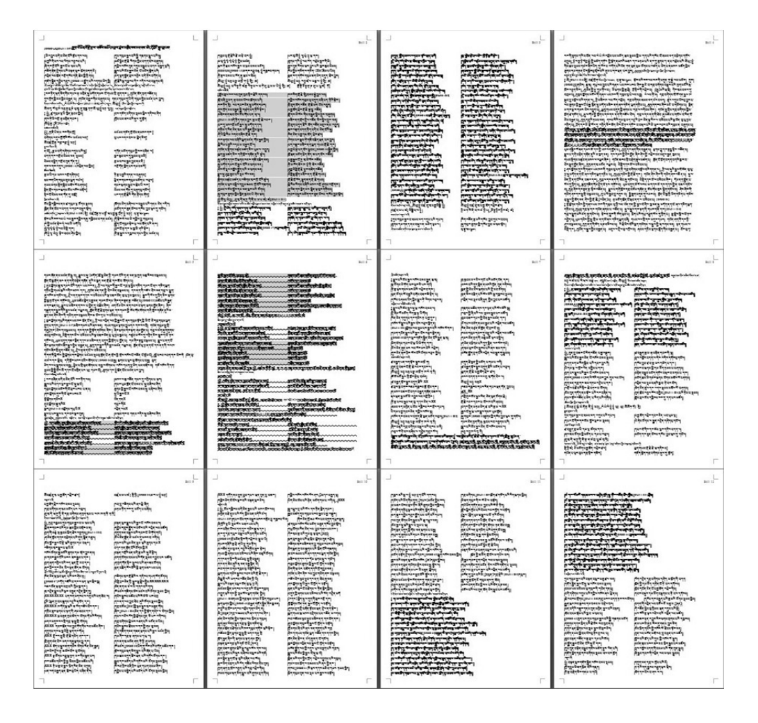
Figure 6. A partial bird's-eye view of the Adamantine Melody ritual text with copied material highlighted: (1) bold, underlined, and shaded lines represent material from the Ten-Chapter Sādhana copied into the Offerings and Praises and the Adamantine Melody ; (2) bold and underlined lines represent material from the Ten-Chapter Sādhana only copied into the Adamantine Melody ; (3) bold lines represent material copied from the Offerings and Praises ; and (4) shaded lines represent material drawn from Ratna Lingpa's Assembly of the Quintessential Mind Attainment .