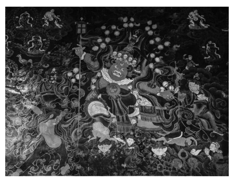
Figure 8. Mural of Dorjé Drakden with his own consort, minister, and emanation; Meru Nyingpa Assembly Hall, Lhasa.

This is the earliest known description of Dorjé Drakden, and it is from another text available in the Nechung Liturgy that was composed by the Fifth Dalai Lama's own student, the treasure-revealer Terdak Lingpa (Gter-bdag gling-pa 'Gyur-med